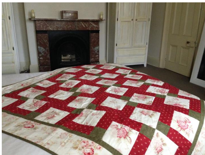
Handmade quilt made by Culburra Patch n chat