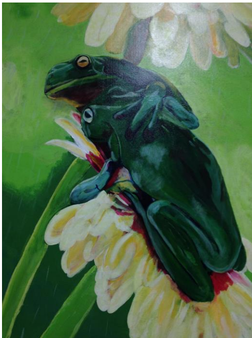
Frog painting by Cliff Campbell